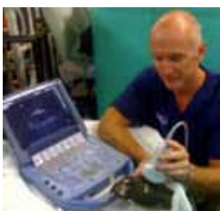
Pictured left: Researcher performing ultrasound on shark egg. Pictured right: Developing shark embryo with yolk within egg.

Zebra sharks are long and sleek, allowing them to wriggle into reef crevices and caves to hunt for their food. Barbels (fleshy feelers) on their snouts help them search for their prey. Zebra sharks hunt at night; in the daytime they usually rest quietly on the bottom, "standing" on their pectoral (side) fins. To reproduce, male sharks use claspers (modifications of the pelvic fins) to transfer sperm into the female's reproductive tract. The zebra female lays fertilized eggs in tough capsules covered with tufts of filaments, which attach the eggs to the seafloor. But these eggs are certainly not like the eggs most recognize! These are opaque and in a tough casing that protects the shark embryo and its yolk during development.